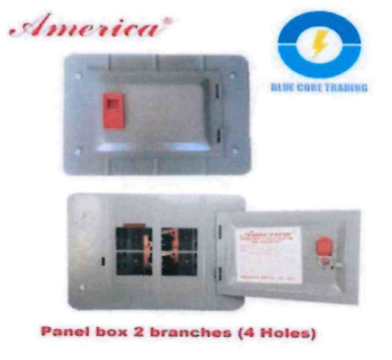
Panel Box 4 Holes, 2 Branches