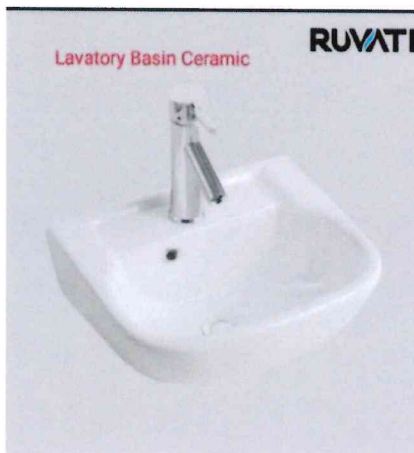
Lavatory Basin Ceramic