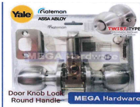
Door Knob Lock Round Handle