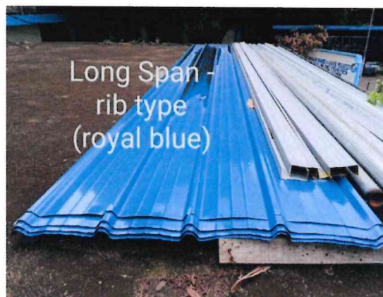
Long span, Rib Type, Royal Blue