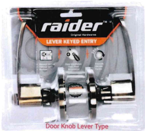
Door Knob Lever Type Lock Set