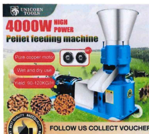
4KW Feed Pelletizer Machine