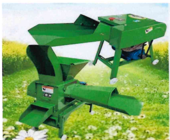
2 KW Electric Shredder Forage Chopper Machine