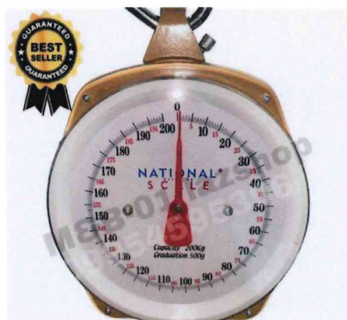
200 kg Capacity Hanging Weighing Scale