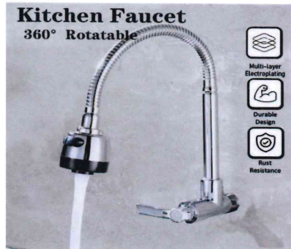
Stainless steel kitchen faucet 360 deg. Flexible with sprayer