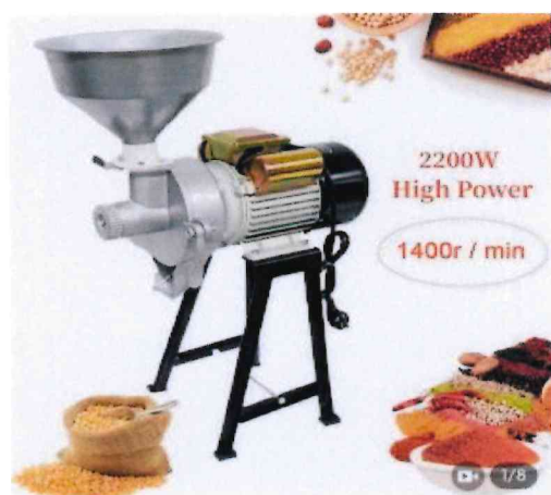
2.2 KW Electric Pulverizing Machine