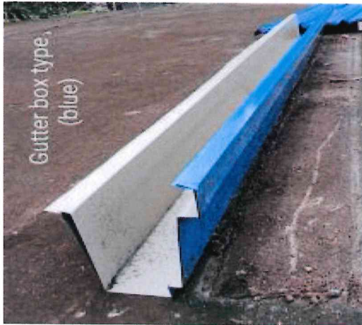
Gutter Box Type (Blue)