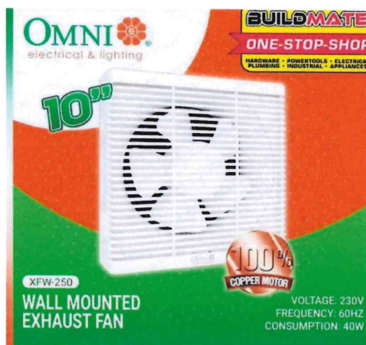
Exhaust Fan #10"