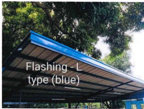
Flashing (Blue) L-Type