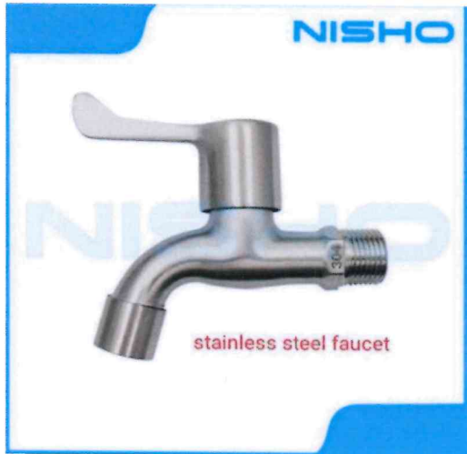
Stainless Steel Faucet