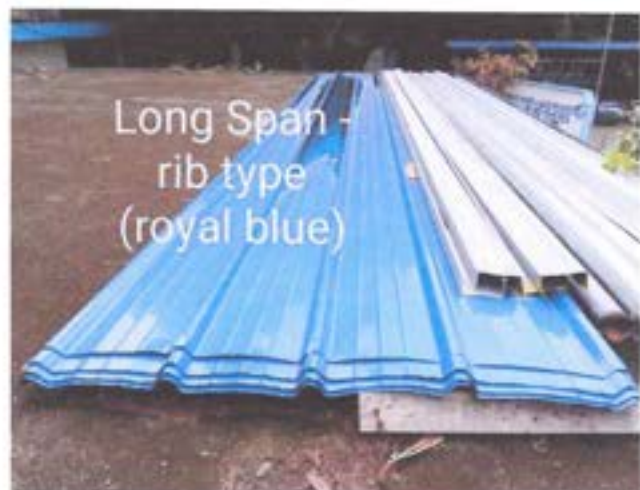
Long span, Rib Type, Royal Blue