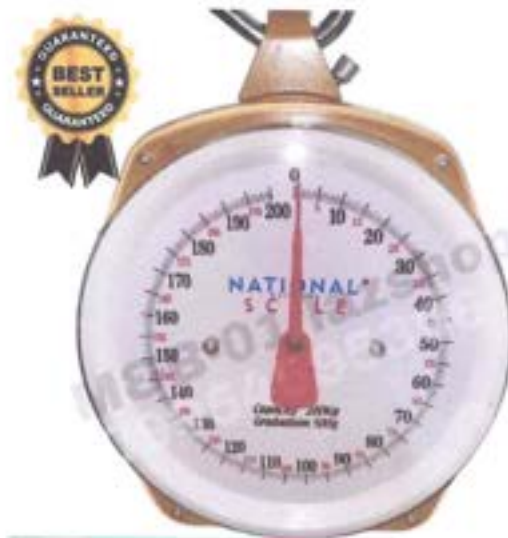
200 kg Capacity Hanging Weighing Scale