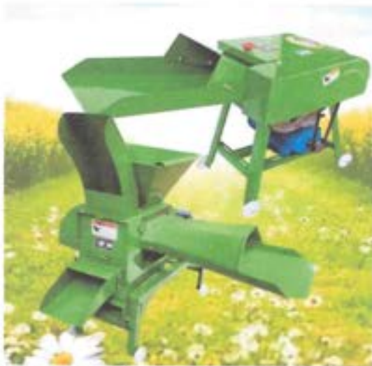
2 KW Electric Shredder Forage Chopper Machine