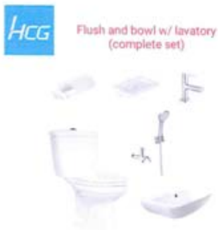
Flush and bowl w/ lavatory (complete set)