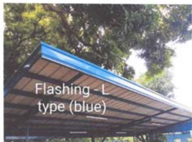
Flashing (Blue) L-Type