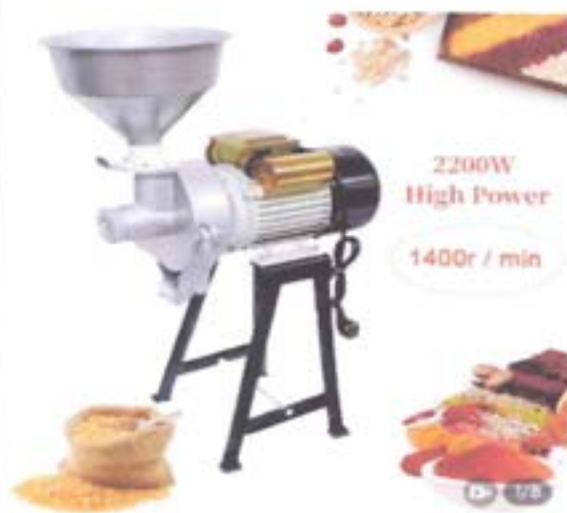
2.2 KW Electric Pulverizing Machine