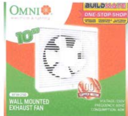
Exhaust Fan #10"