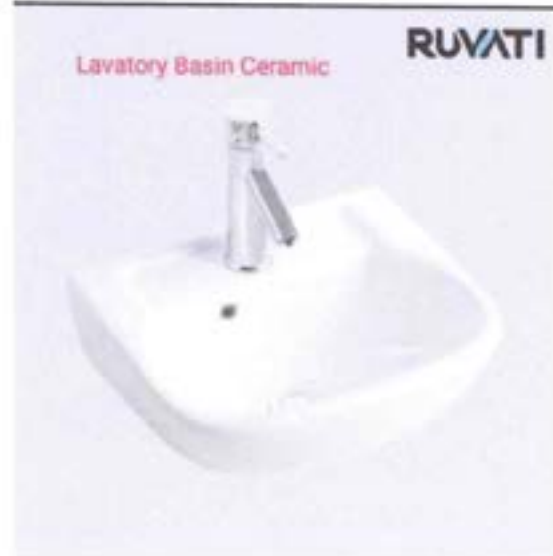
Lavatory Basin Ceramic