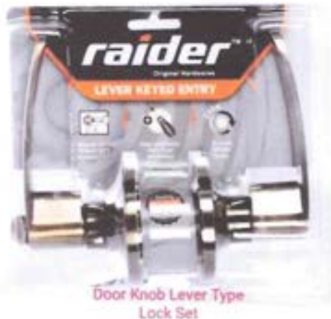
Door Knob Lever Type Lock Set