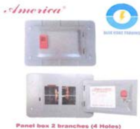
Panel Box 4 Holes, 2 Branches