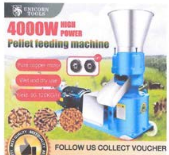
4KW Feed Pelletizer Machine