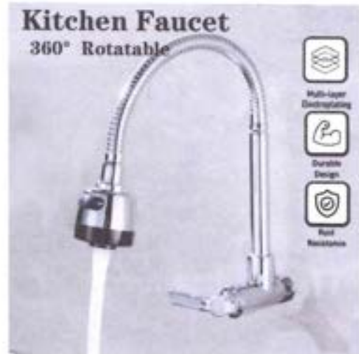
Stainless steel kitchen faucet 360 deg. Flexible with sprayer