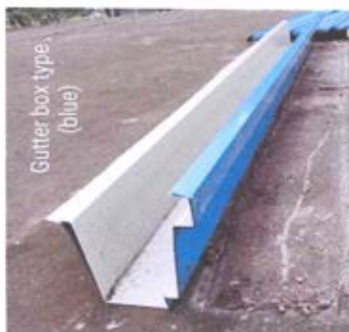
Gutter Box Type (Blue)