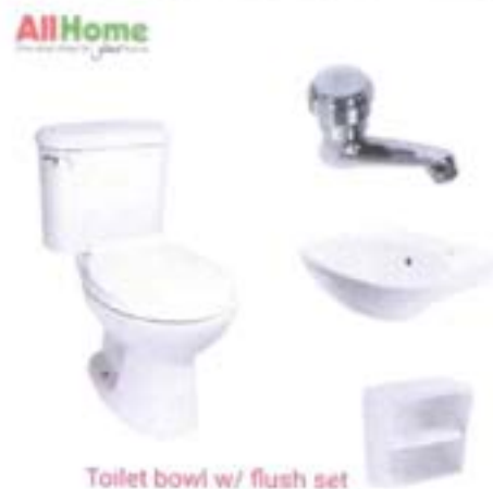
Toilet bowl w/ flush set