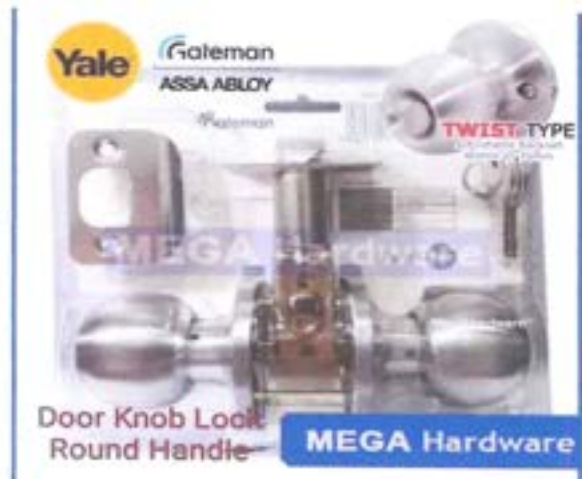
Door Knob Lock Round Handle