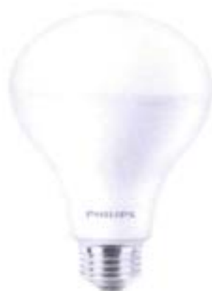
13 W LED Bulb