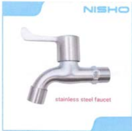
Stainless Steel Faucet