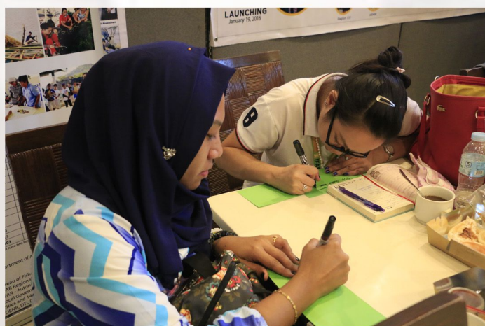
Participants write what their expectations of the workshops are during the opening rites. During the first day, participants also updated other projects on their GAD efforts.