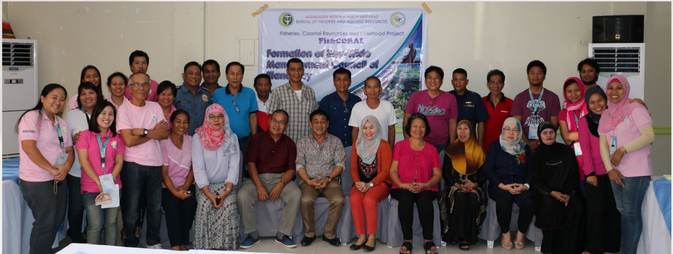
Representatives of different offices from ARMM make up the Illana Bay Management Council. Together, they will collaborate towards strengthening coastal resources management in Illana Bay.

The Fisheries, Coastal Resources and Livelihood (FishCORAL) Project achieved yet another milestone as its Regional Project Management Office (RPMO) in the Autonomous Region in Muslim Mindanao (ARMM) successfully formed a Bay Management Council for Illana Bay. On February 7, 2017, the FishCORAL ARMM, with representatives from the regional agencies of Department of Agriculture (DA), Department of Environment and Natural Resources (DENR), Bureau of Fisheries and Aquatic Resources (BFAR), the Local Government Units (LGUs) and Philippine Coast Guard, formally established the Illana Bay BMC to address coastal resources management issues in the bay.