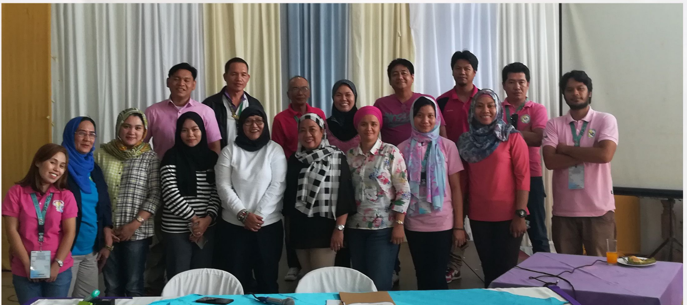
BFAR ARMM Regional Director with FishCORAL RPMO staff and RCSC members gather during their quarterly meeting. RCSC members are encouraged to appoint permanent alternates to attend the meetings on behalf of the members.