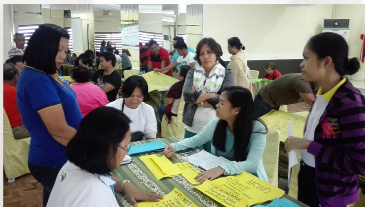
Left: TOF participants introduce FishCORAL to an organization based in Tanauan. After the introduction, the PO members identified which commodity they want to develop for enterprise. Right: Participants assess their outputs and learnings on the field visits. After the workshops, representatives from each group presented their outputs.