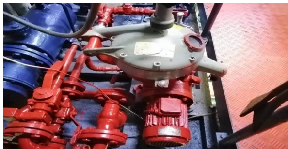
PHOTO DOCUMENTATION OF LUBE OIL PURIFIER